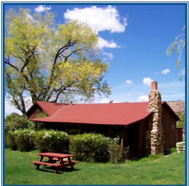
Cabin at Pack Creek Ranch, Moab, Utah